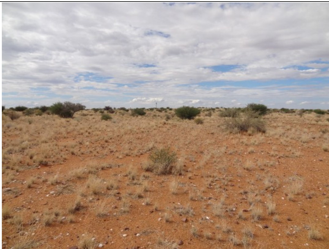
Figure 1: Ground cover of the preferred site in the area where the solar plant is proposed. Windmill on the ridge in distance