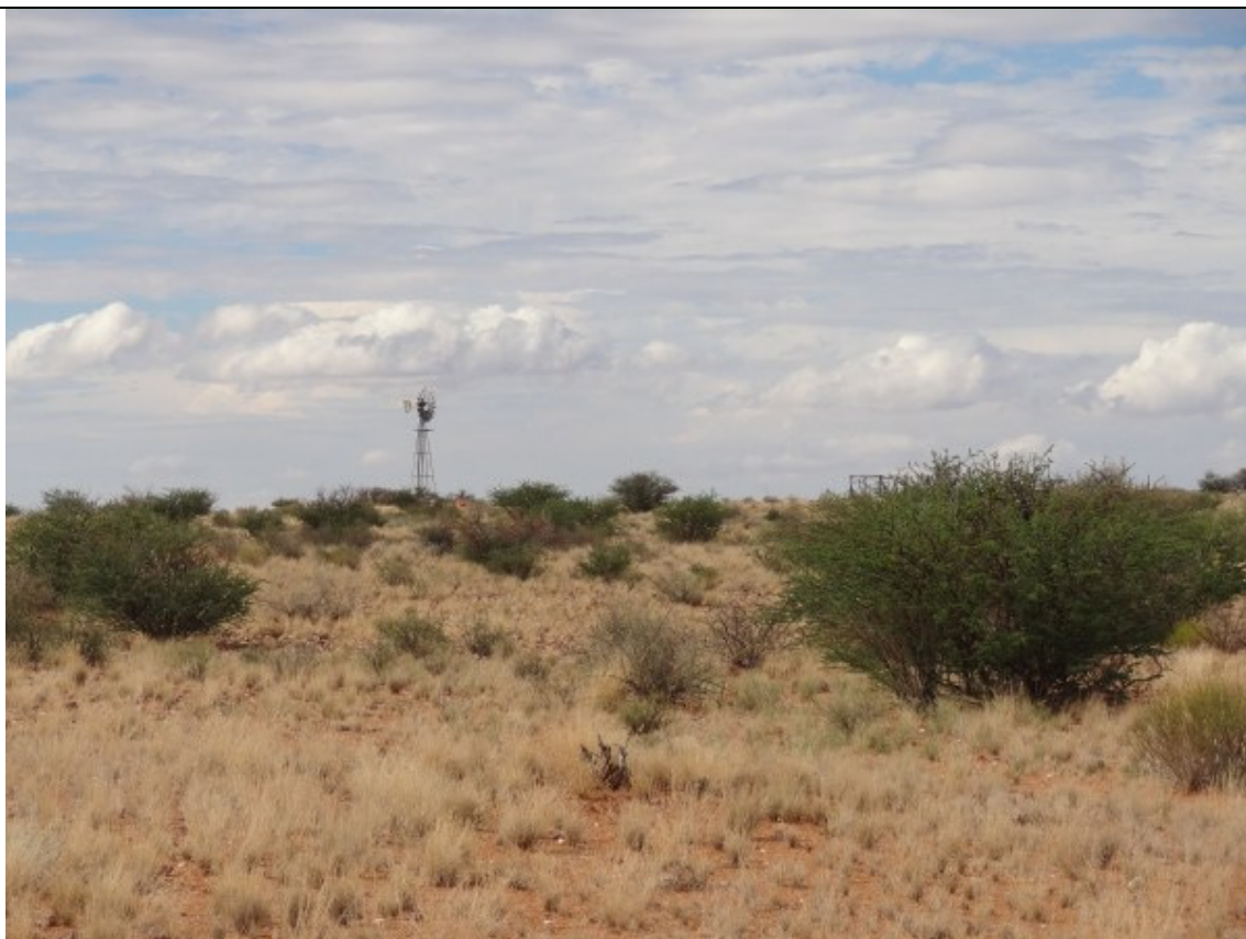
Figure 3: Windmill on ridgeline. Photo taken from preferred site in a north-easterly direction.