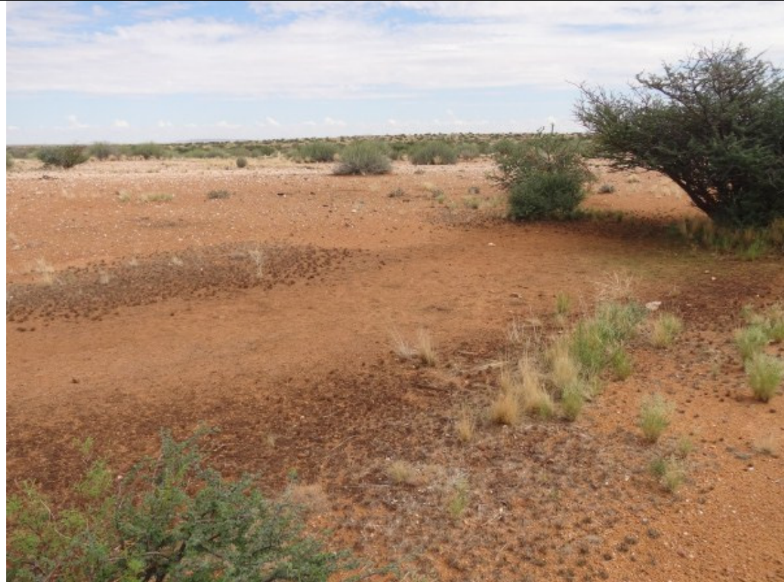
Figure 4: Dry animal drinking hole (no 1) on the preferred site