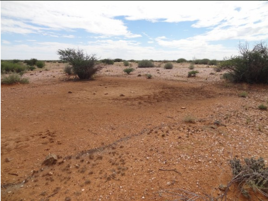
Figure 5: Dry animal drinking hole (no 2) to the west of the preferred site