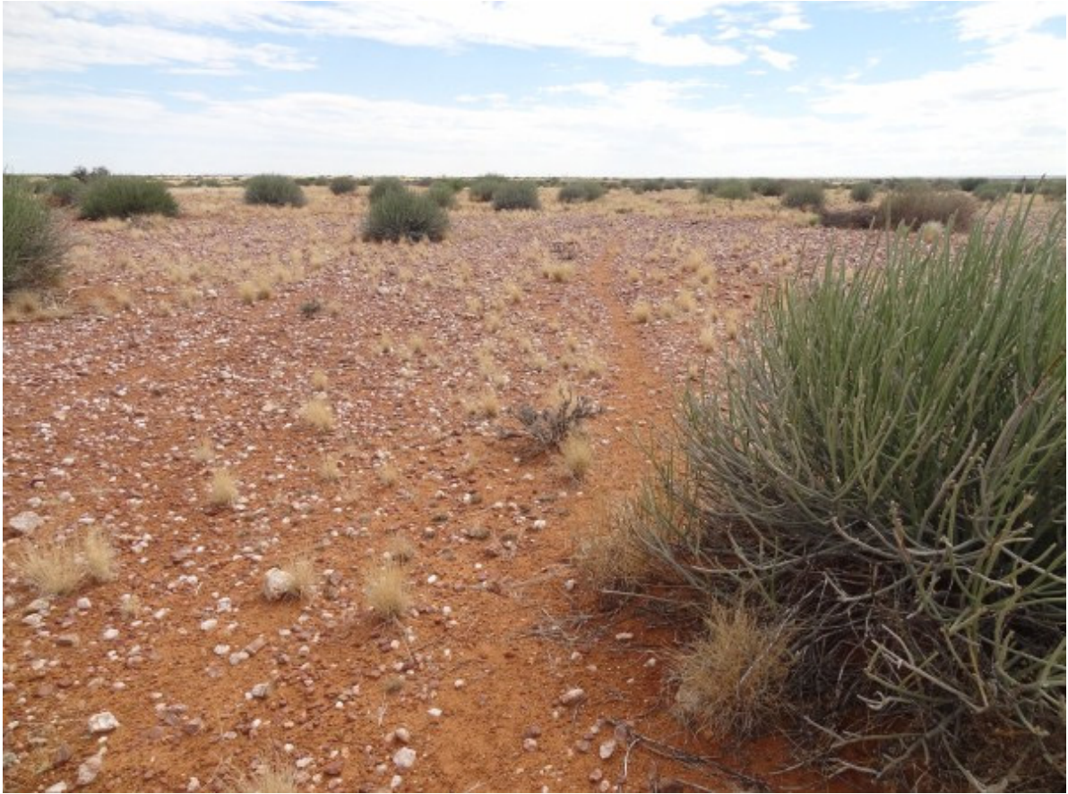
Figure 7: Animal track (likely cattle) on the preferred site