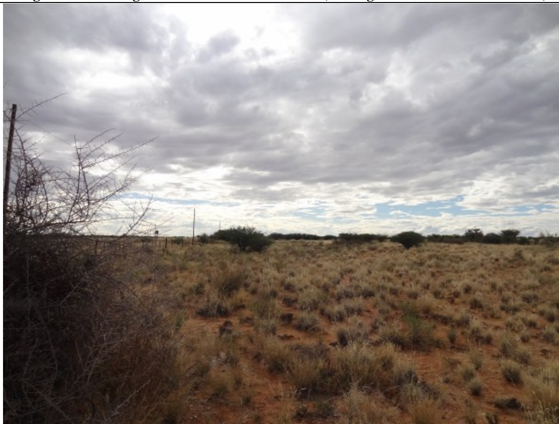
Figure 12: General ground cover on alternative site. Photo taken from access gate looking west along fence line next to R359