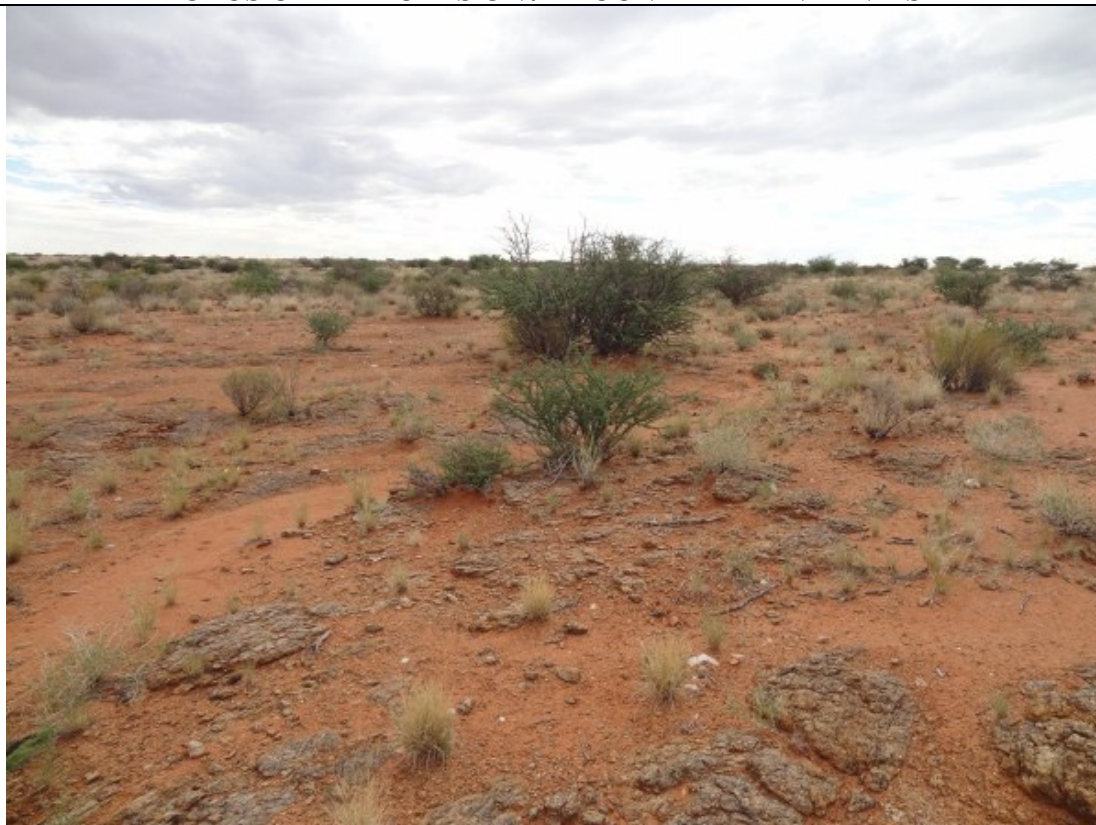
Figure 11: Drainage line close to alternative site (looking northwest towards the site)