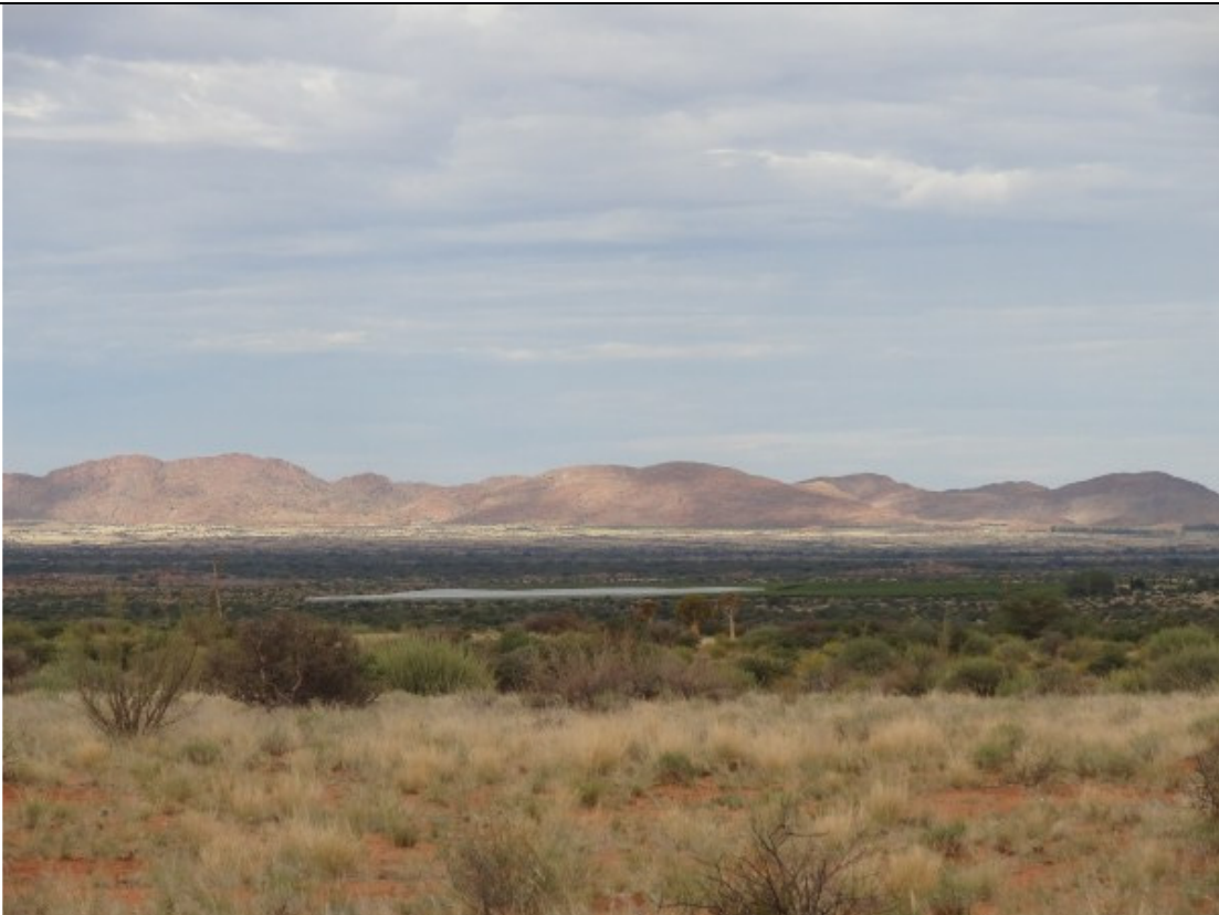
Figure 14: Vineyard covered with shade cloth in the distance to the northeast of alternative site