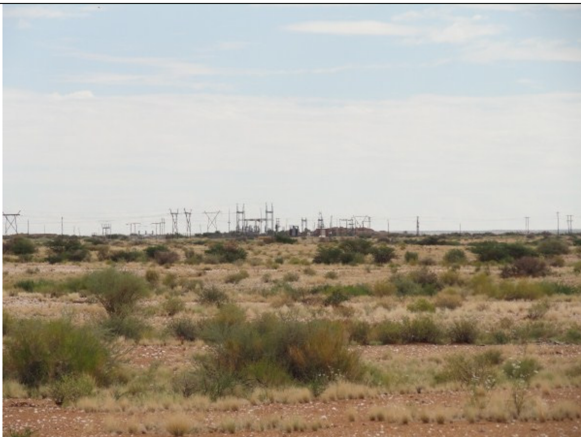
Figure 9: Blouputs substation to the southwest of the site (approximately 4km)