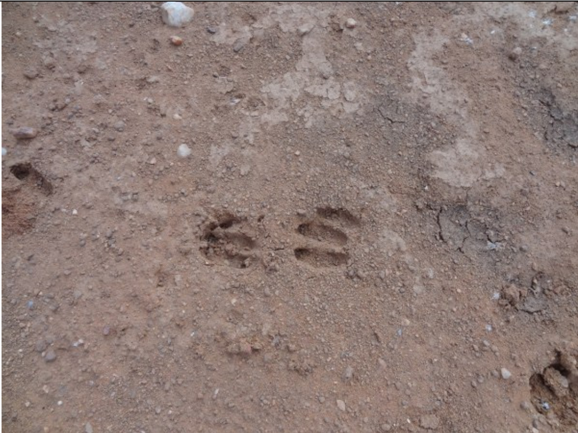
Figure 6: Animal tracks (aardvark) at waterhole hole (1) close to the preferred site, which was dry at the time of the site visit (22 February 2012)