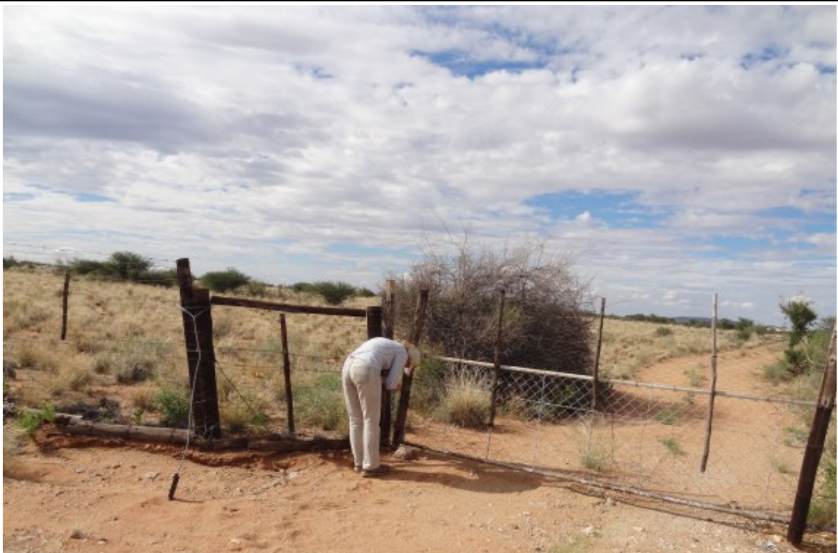
Figure 8: Gate of access track to preferred site (photo taken from R359 tarred road). The proposed site lies to the left of the track in the visible distance.