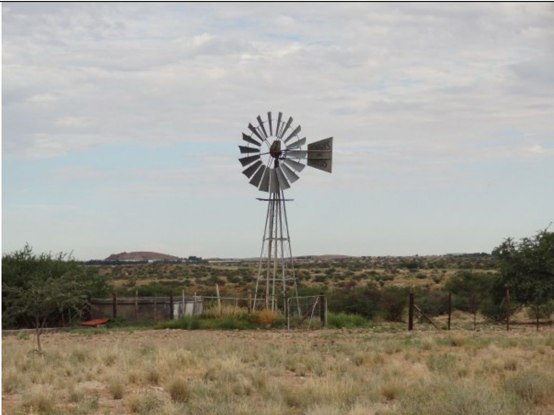
Figure 13: Windmill to the east of alternative site (looking east)