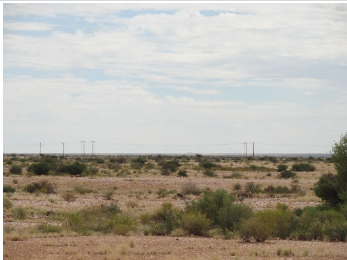
Figure 10: Power line on the western border of the farm running south towards the Blouputs substation