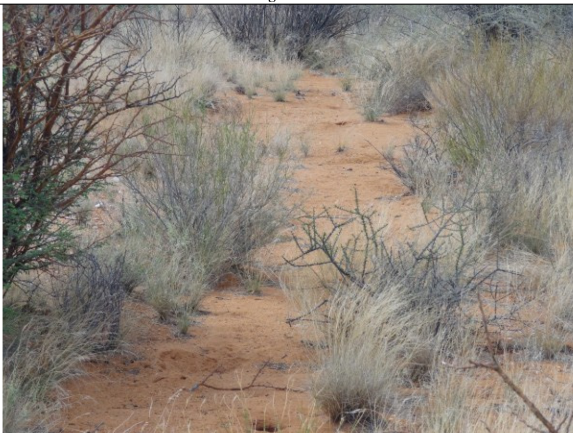
Figure 2: Drainage line (visible on various positions on the both preferred and alternative sites)