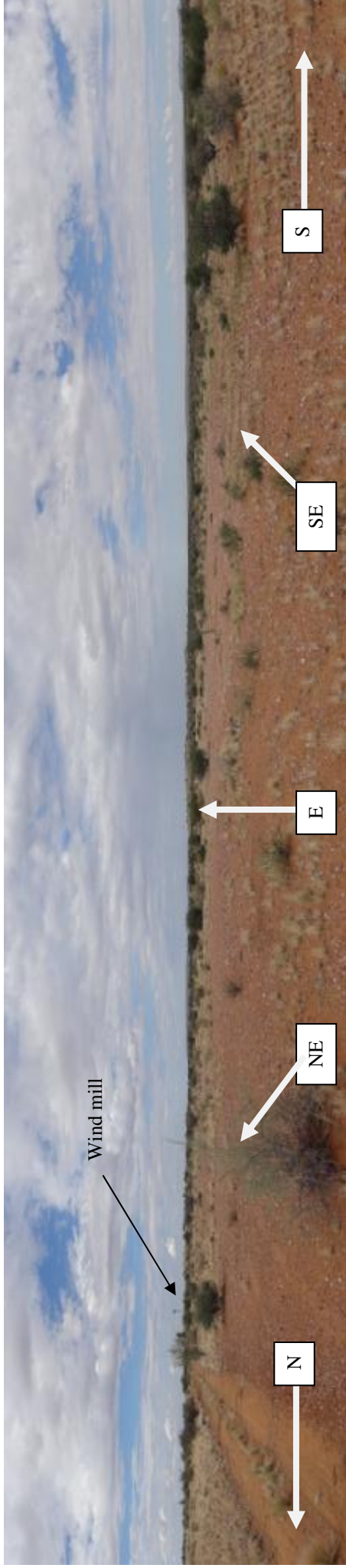
Figure 2: View towards preferred site looking east. This panorama shot (180°) was taken from north to south from the current access track (visible to the left), the visible horizon is the same ridgeline as in Figure 1.