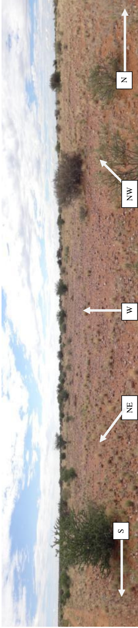
Figure 3: View towards preferred site looking west. This panorama shot (180°) was taken from south to north from the current access track (visible to the left)